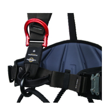
MOTION SYSTEM front view