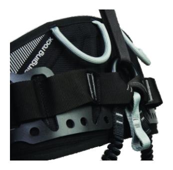
MOTION SYSTEM back view