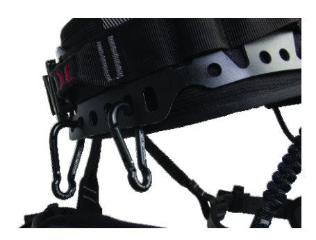
multi-gear loop view